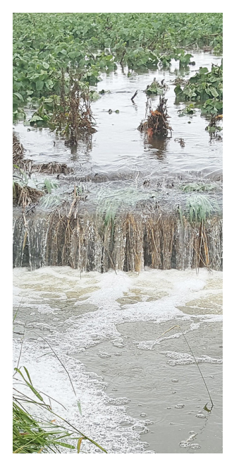
Keep irrigation water and nutrients within the field without runoff